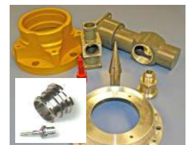
Screw Machine, Swiss & CNC Milling

For more information send us an email at sales@knight-reber.com and one of us will respond.