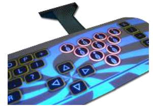
Membrane Switches, Rubber Keypads, Sensors & Custom Touch Screens