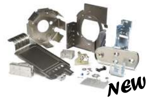
Metal Stamping & Laser Cutting