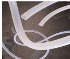
Plastic Tubings & Hose