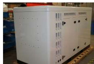
Sheetmetal & Powder Coat