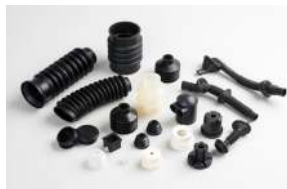
Rubber Molding & Extrusion