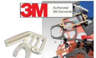
Die Cutting & CNC Routing