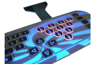
Membrane Switches, Rubber Keypads, Sensors & Custom Touch Screens