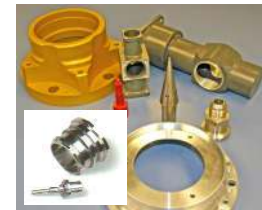
Screw Machine, Swiss & CNC Milling

For more information send us an email at sales@knight-reber.com and one of us will respond.