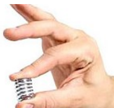
Springs & Stampings