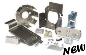
Metal Stamping & Laser Cutting