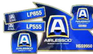
Screen or Digital Printed Decals, & Labels